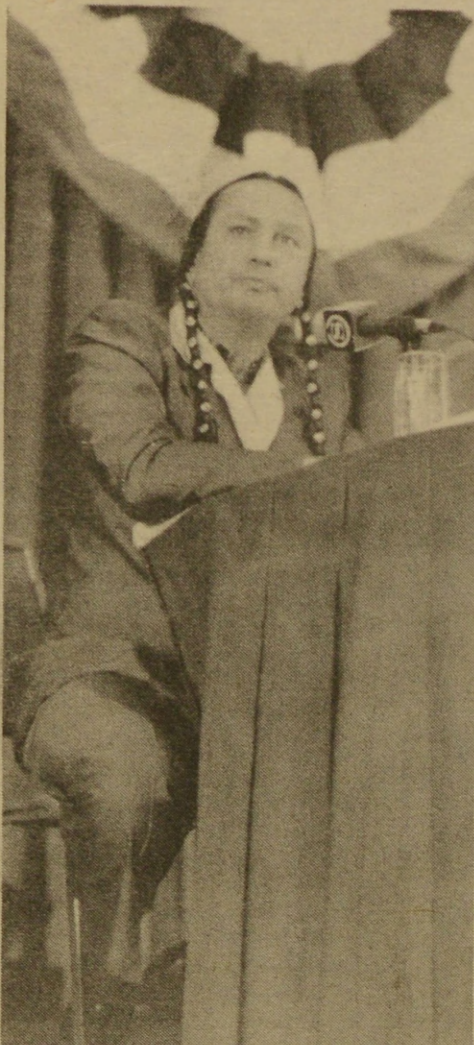
Russell Means will lead the new Party caucus, FIFE.