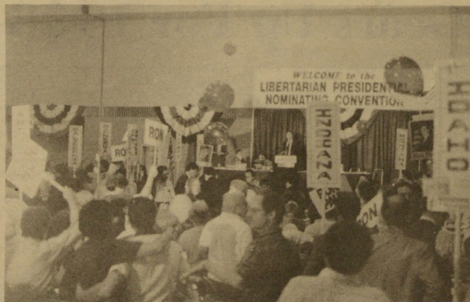
Convention delegates dance and shout during the Ron Paul victory demonstration.

With the nominations closed and only one candidate, the convention accepted Andre