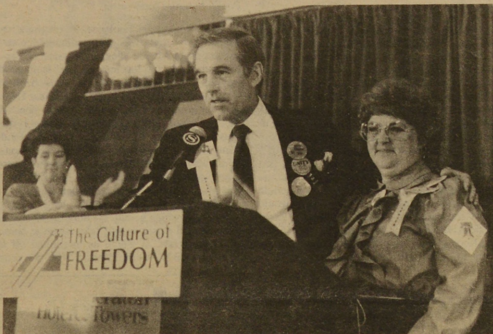
Ron Paul, with his wife Carol, accepts the Libertarian Party's presidential nomination.

In a press conference following the election, Paul said that in the upcoming campaign he